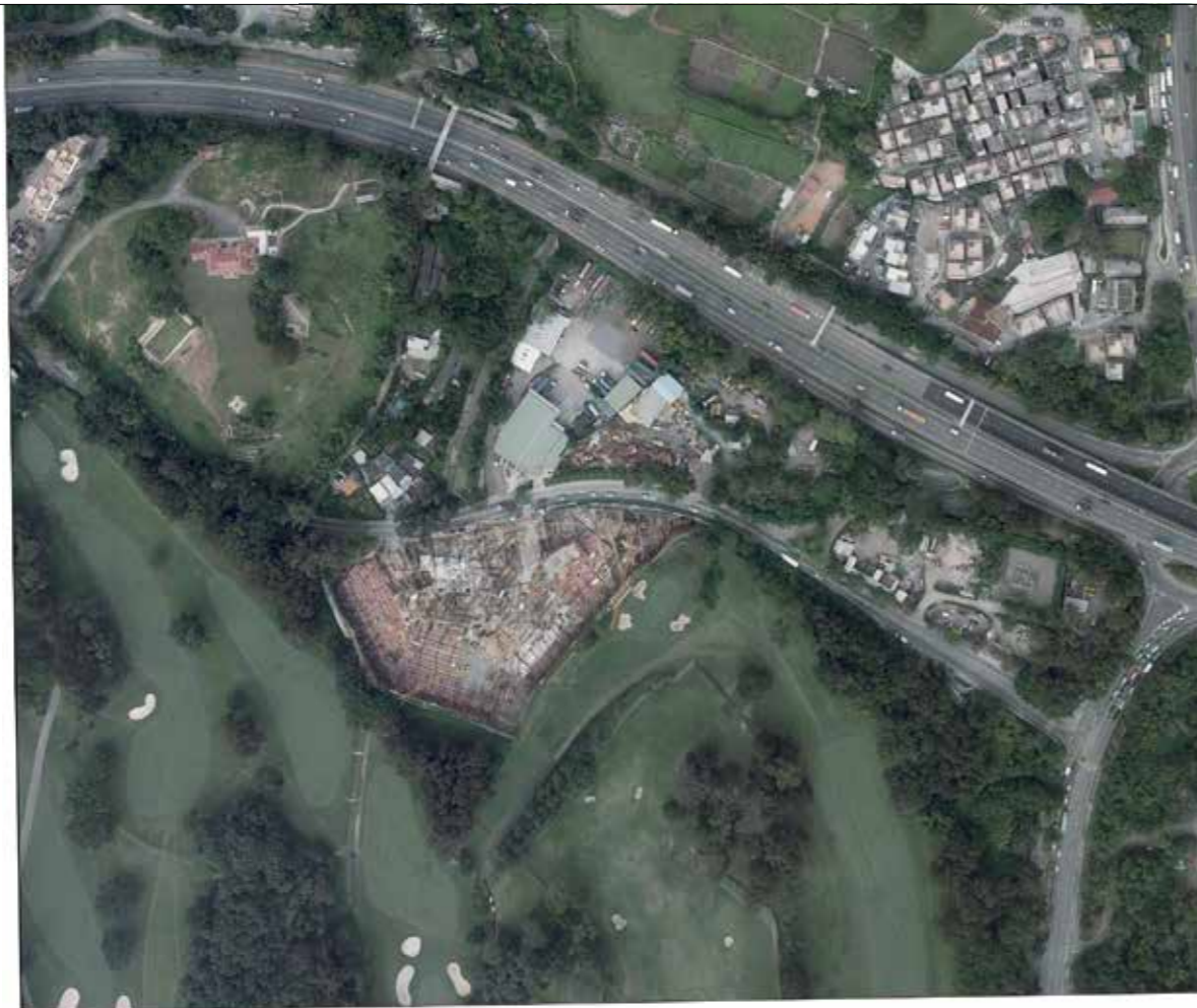
鳥瞰照片並不覆蓋本空白範圍 This blank area falls outside the coverage of the relevant aerial photograph