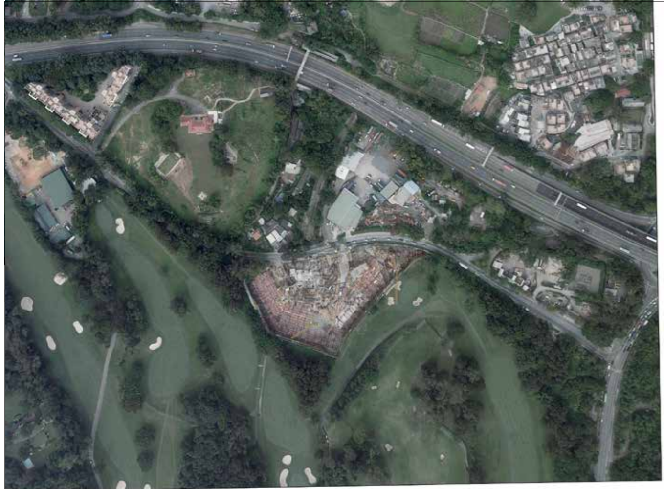
鳥瞰照片並不覆蓋本空白範圍 This blank area falls outside the coverage of the relevant aerial photograph