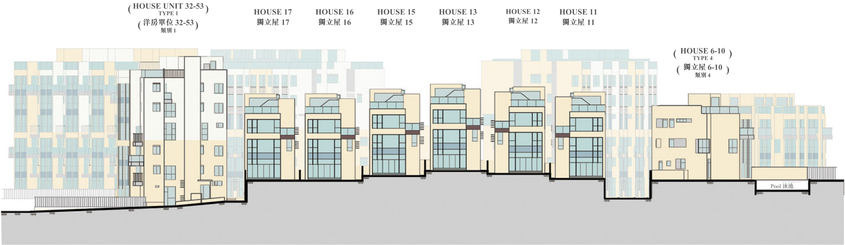
ELEVATION III (Facing The Adjoining North-West Open Sloping Space) 立面圖 III (面向毗鄰西北公用斜坡空間)