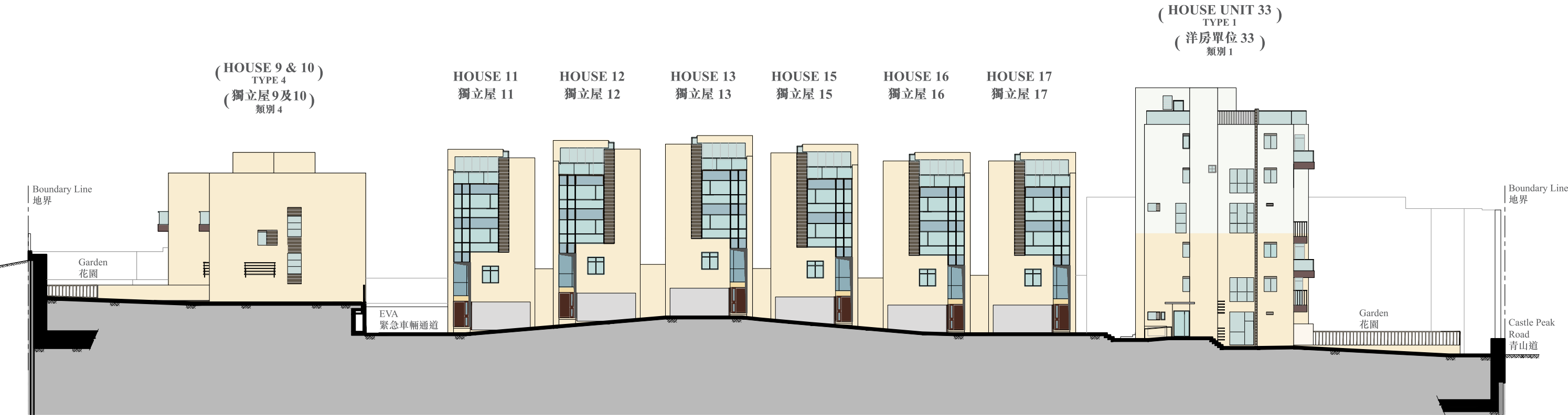
ELEVATION D (Facing Internal EVA Access) 立面圖 D (面向內部緊急車輛通道)