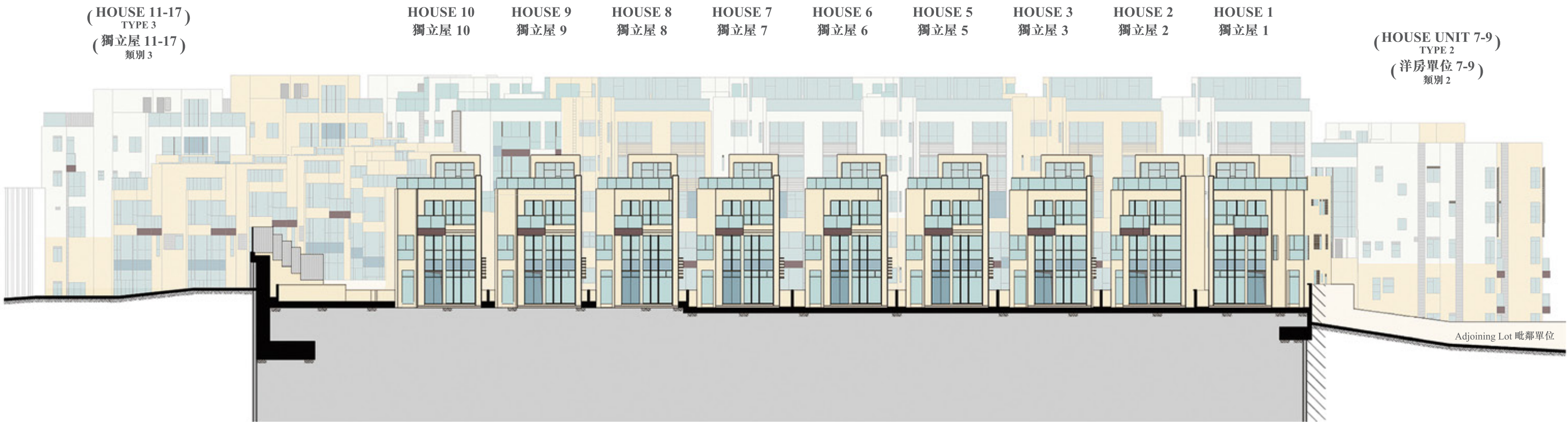
ELEVATION II (Facing The Adjoining Western Open Sloping Space) 立面圖 II (面向毗鄰西公用斜坡空間)