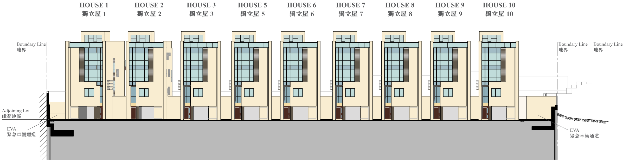
ELEVATION B (Facing Internal EVA Access) 立面圖 B (面向內部緊急車輛通道)