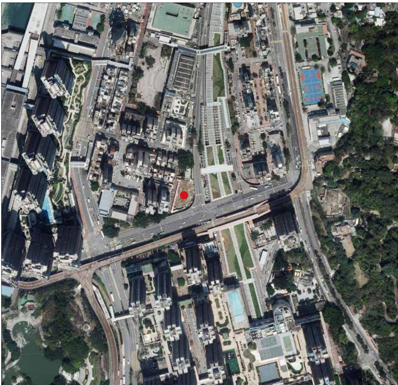
● Location of the Development 發展項目的位置

Adopted from part of the Aerial Photograph taken by the Survey and Mapping Office of the Lands Department at a flying height of 6,900 feet, Photo No. E017959C, dated 2 April 2017.