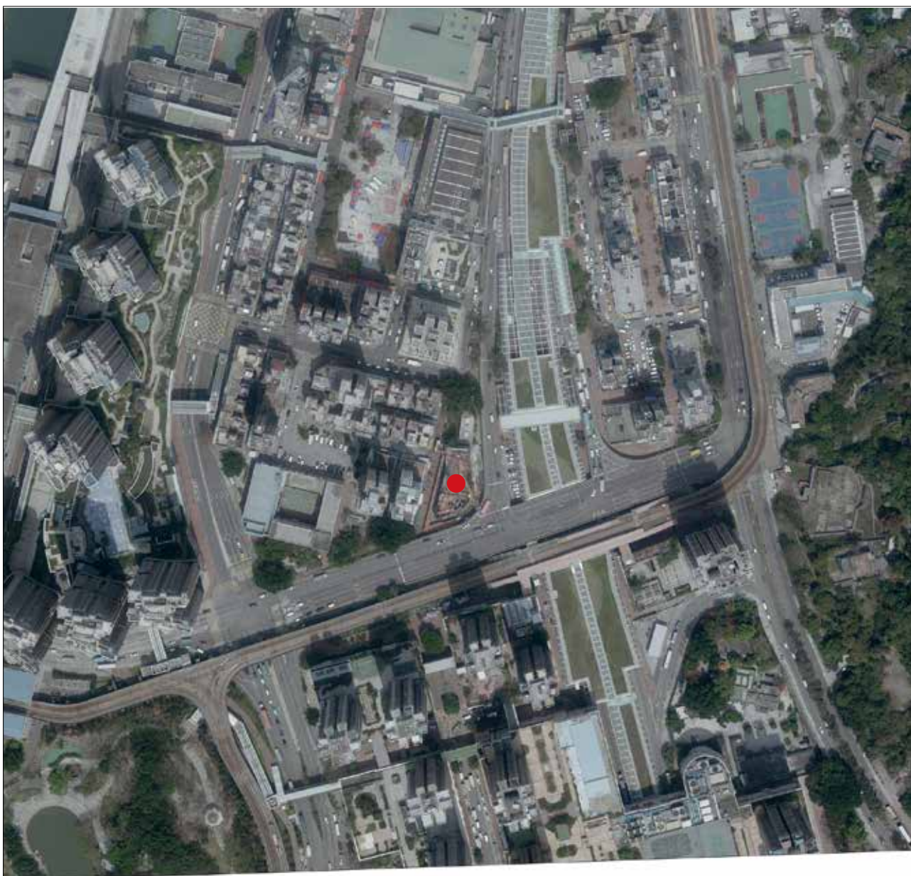
This blank area falls outside the coverage of the aerial photograph 鳥瞰照片並不覆蓋本空白範圍