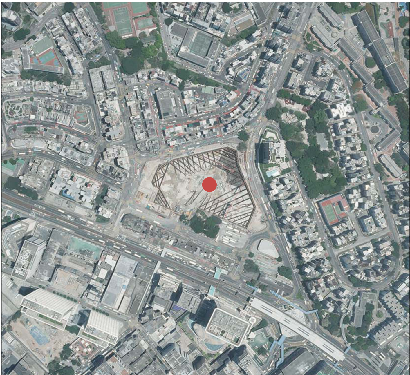
Location of the Phase 期數的位置

Adopted from part of the aerial photograph, No. E028244C, dated 29 May 2017, taken by the Survey and Mapping Office, Lands Department, The Government of the Hong Kong Special Administrative Region at a flying height of 6900 feet.