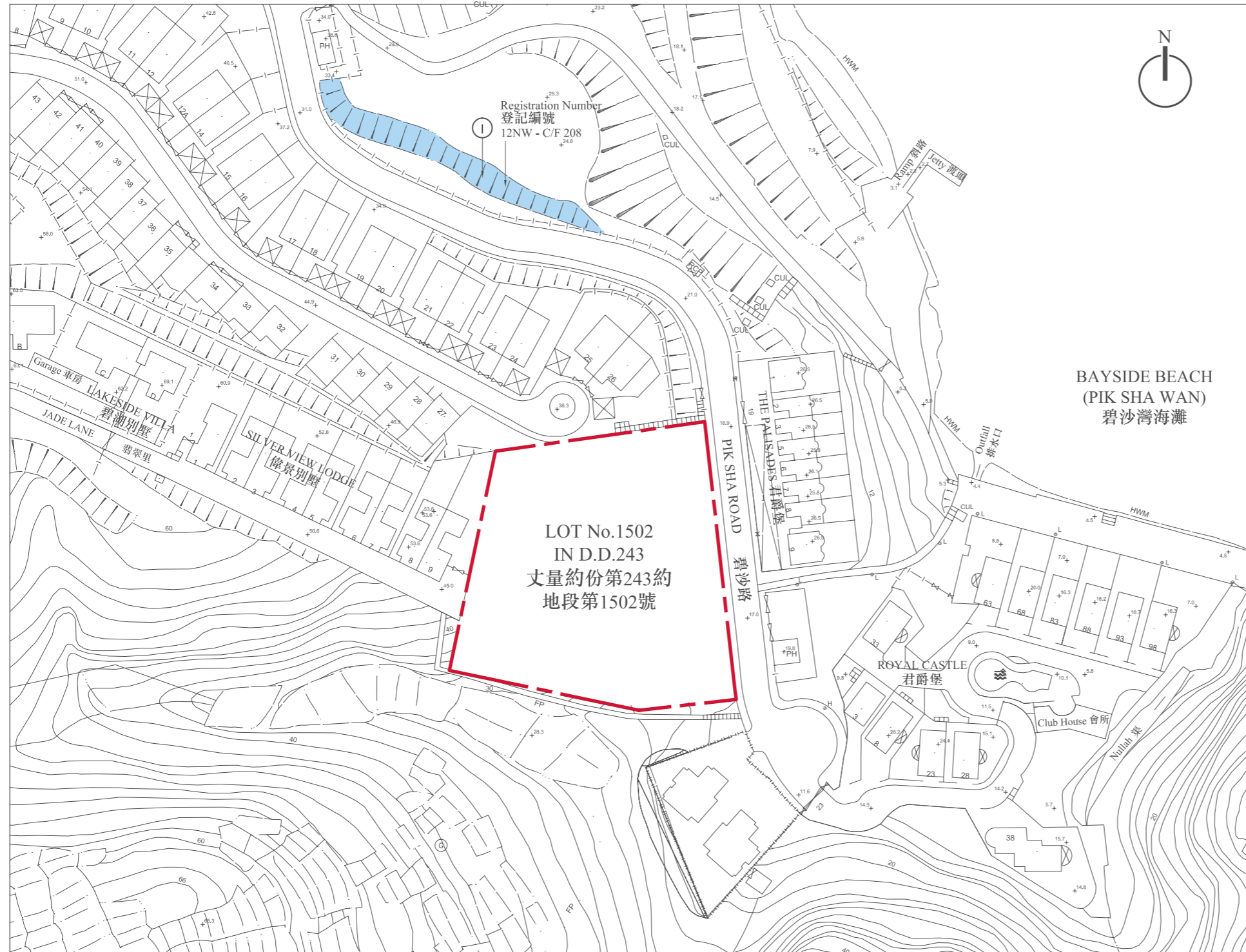
SLOPES AND RETAINING WALL PLAN 2 斜坡和擋土牆示意圖 2