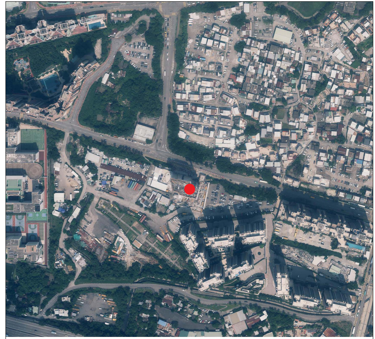
This blank area falls outside the coverage of the aerial photograph 鳥瞰照片並不覆蓋本空白範圍

摘錄自地政總署測繪處於2019年9月23日在6,900呎飛行高度拍攝之鳥瞰照片，編號為E064341C。